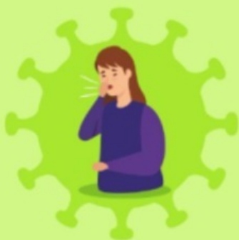
Transmission by cough/sneeze